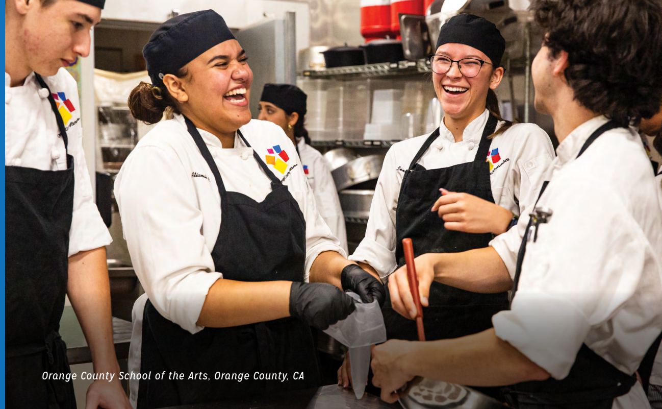
Orange County School of the Arts, Orange County, CA