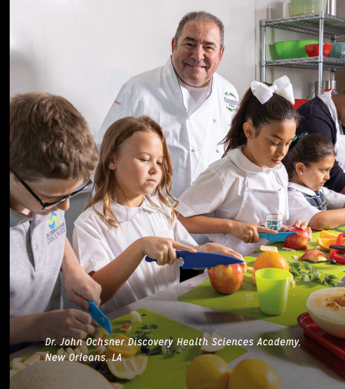
Dr. John Ochsner Discovery Health Sciences Academy, New Orleans, LA